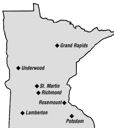
Locations of alfalfa trials.

Yield results for alfalfa varieties tested in current Minnesota yield trials (2001 to 2005 seeding years) are listed in tables 1 through 4. Varieties in current winter survival, forage quality and potato leafhopper trials are listed in tables 5 through 7. Alfalfa variety seed marketers, telephone numbers and web addresses are provided in table 8. Disease resistance information for alfalfa varieties is available on the web at www.alfalfa.org .